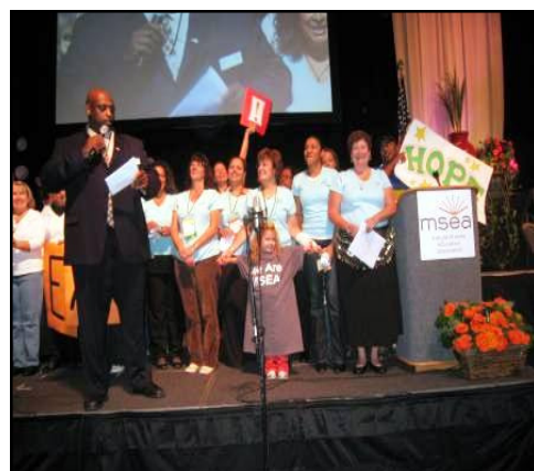
HCEA members performed a "We are MSEA" jingle at the MSEA Convention.