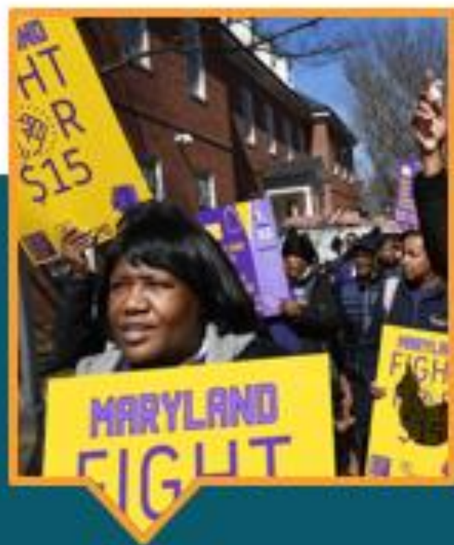
FIGHT FOR 15